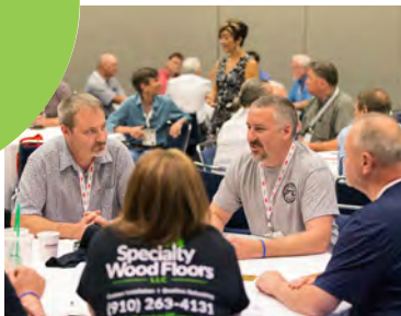
NWFA INDUSTRY GUIDE